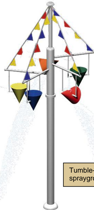
Tumble-bucket sprayground feature