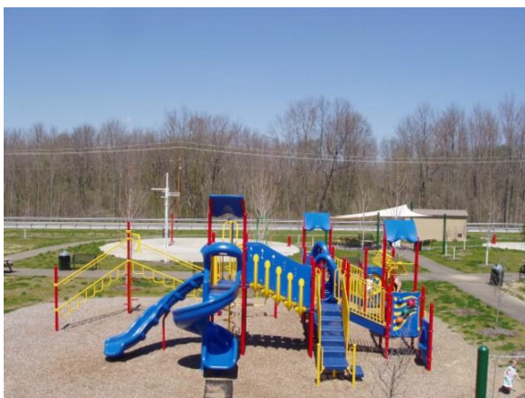
Eagle Park Playground