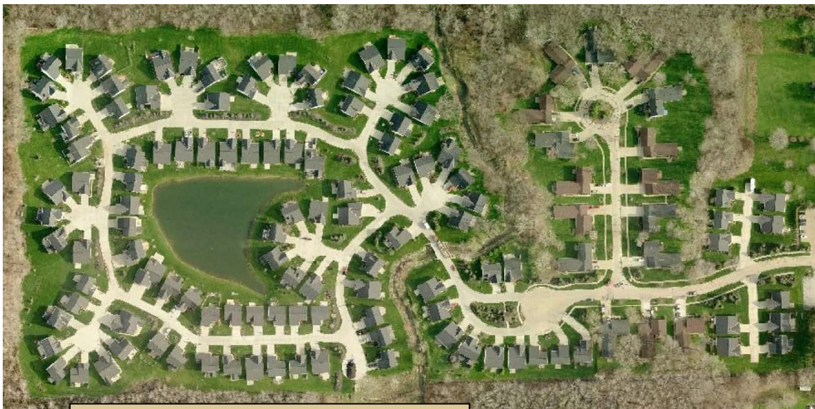
Aerial Photograph of Sweet Brier Condominiums