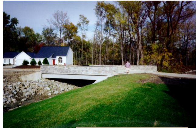
Pre-stressed Pre-cast Bridge

The Project Site is bisected by Rand Ditch, a tributary to Arcola Creek. Foresight Engineering designed a pre-stressed pre-cast bridge for the roadway over the ditch. Additionally, Foresight Engineering completed a Federal Emergency Management Agency (FEMA) Floodplain Study to ensure the site compliance with all applicable floodplain building requirements.