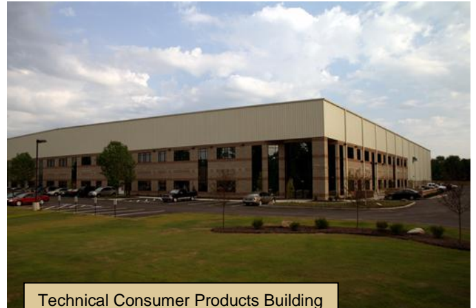
Technical Consumer Products Building in Aurora, Ohio